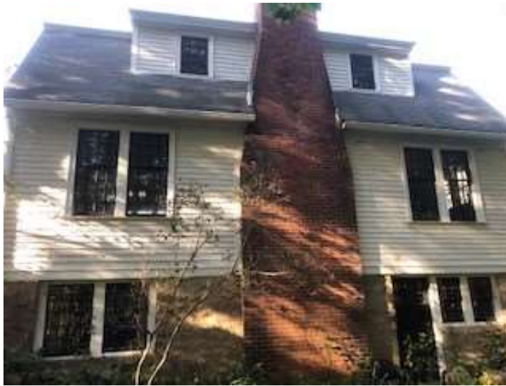
Back – South Side