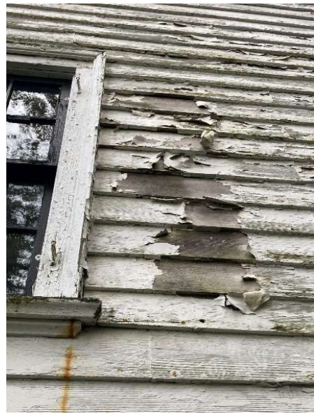
West side details