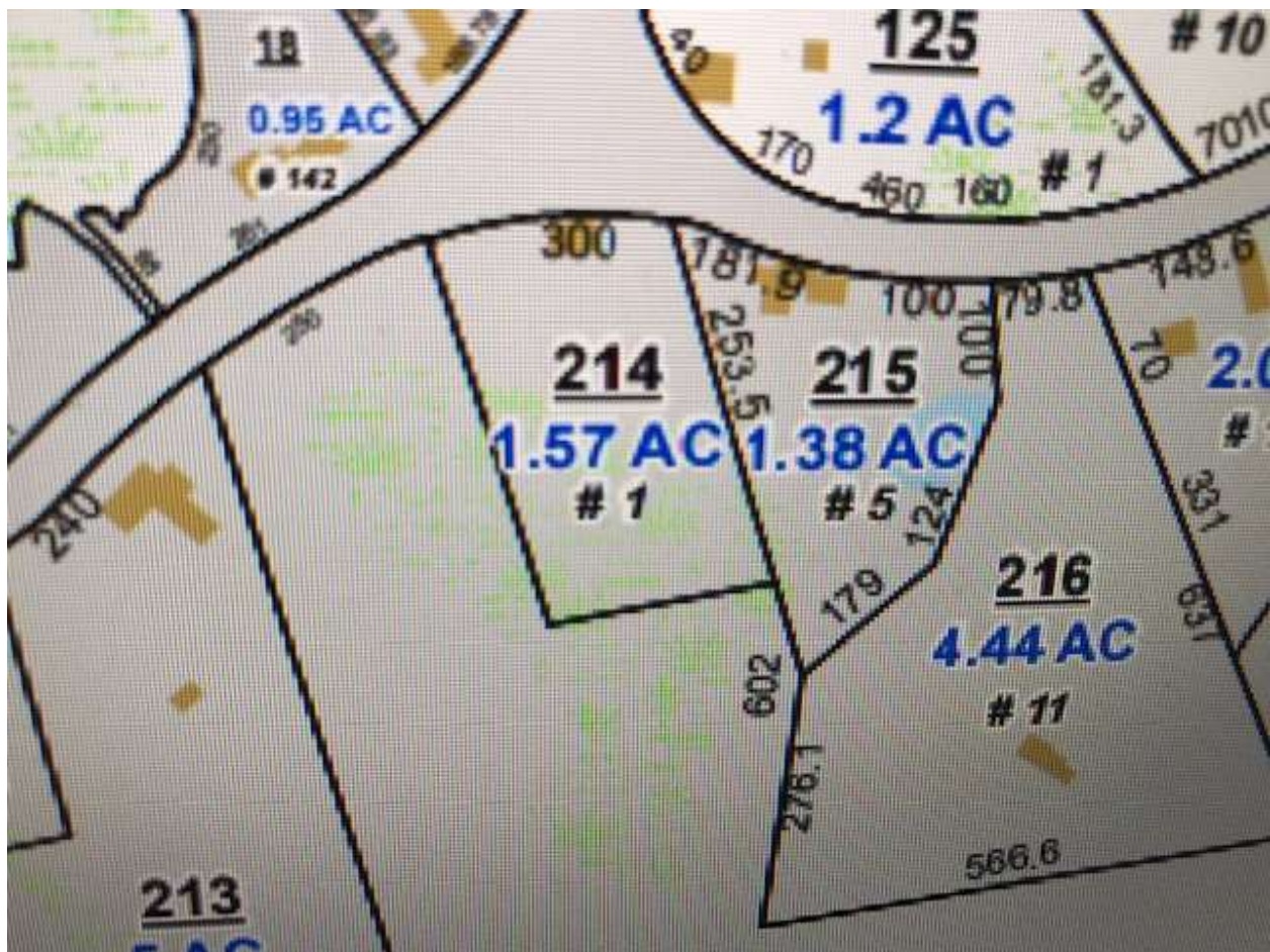
Assessors Map - Field Building is on Parcel 214