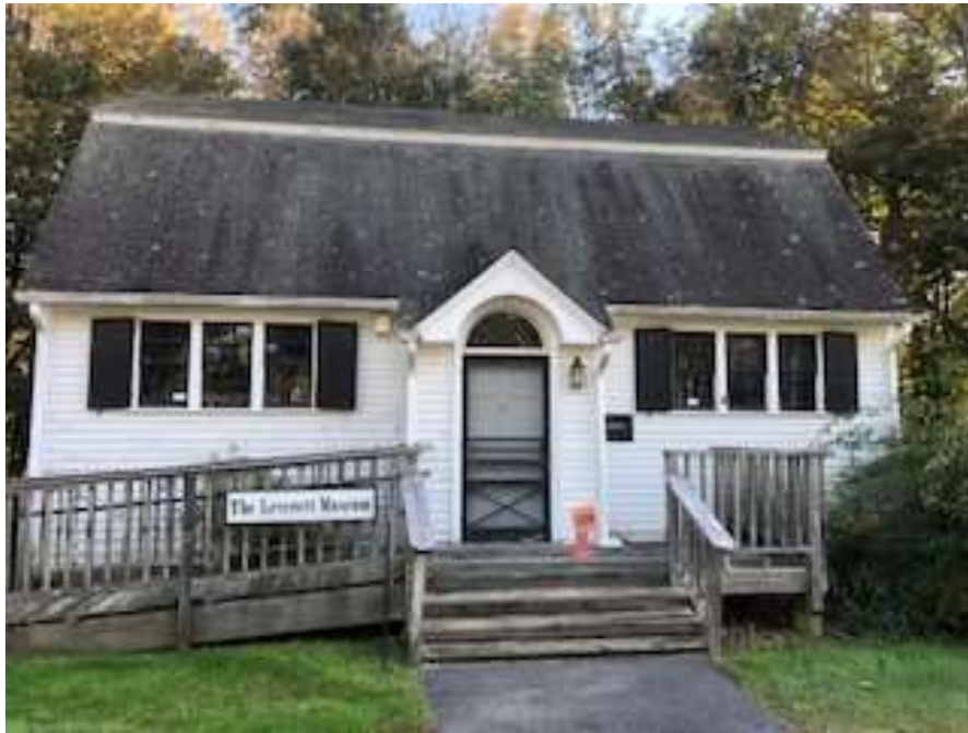
Front – North Side